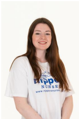
Mairead QTS Primary